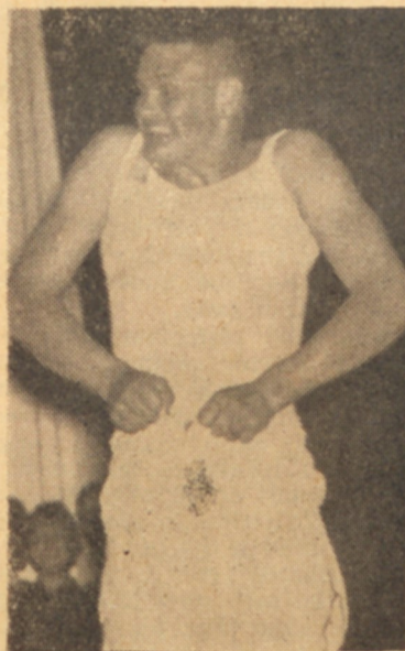
UGGH seems to be what's on this freshman's face as he does penance for crimes committed against the sophomore class.