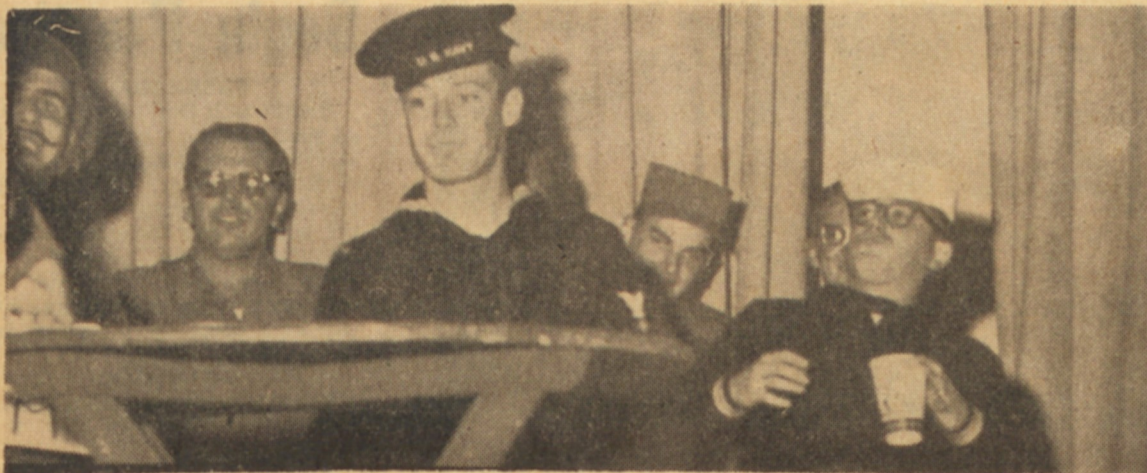
Some of the Vet's Club at their pep skit at the kick-off convocation Monday night.