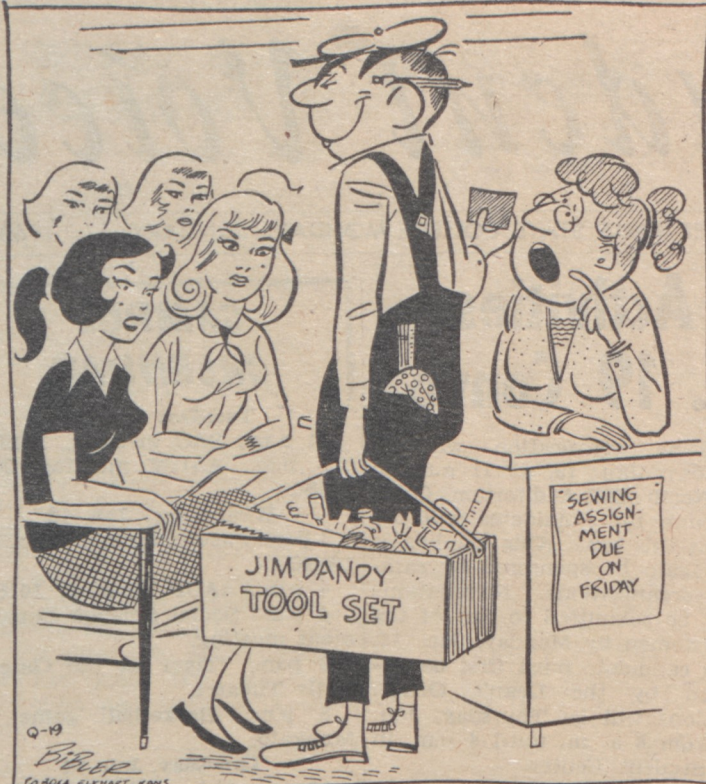
"WELL, YES, YOUR ENROLLMENT CARD DOES SAY 'HOMEMAKING' - BUT I'M AFRAID -"