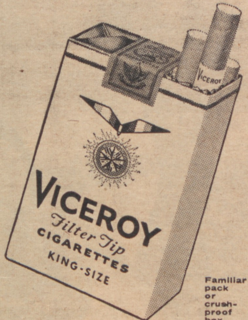
Familiar pack or crush-proof box.

When you depend on judgment, not chance, in your choice of cigarettes, you're apt to be a Viceroy smoker. You