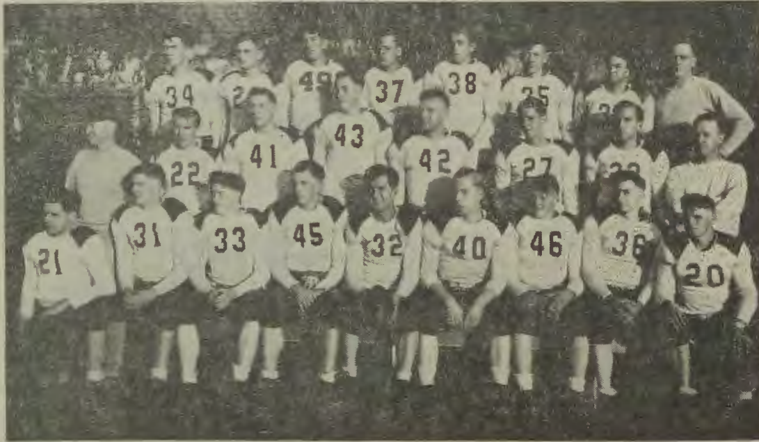
THE 1945 FALCONS