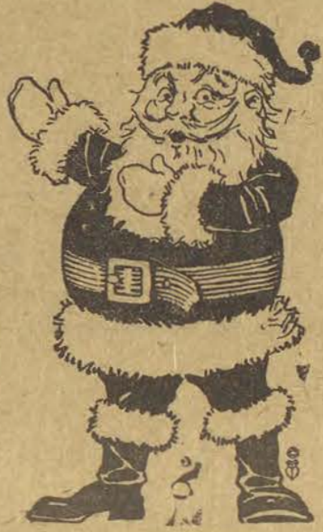
SHOW THIS TO THE COOK

This play was presented a week ago at Clayton, Wis., and is booked for several future engagements in towns surrounding River Falls.