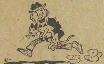
We're going home for Christmas a week from today!