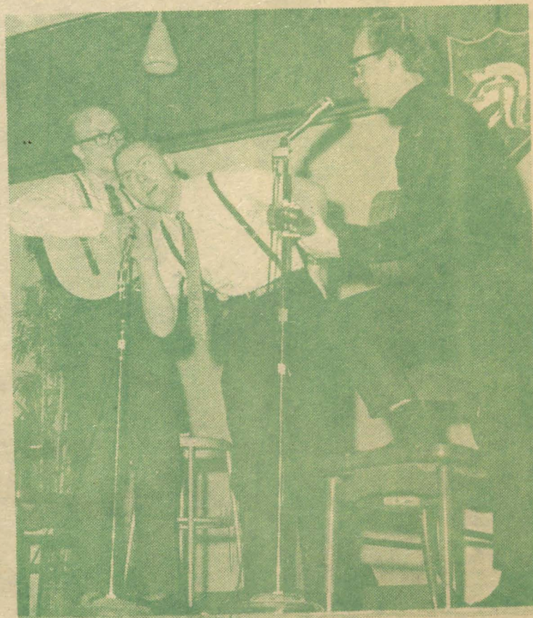
PANACIAN'S perform during annual fall hootenany.